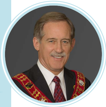
Mayor Wayne Redekop