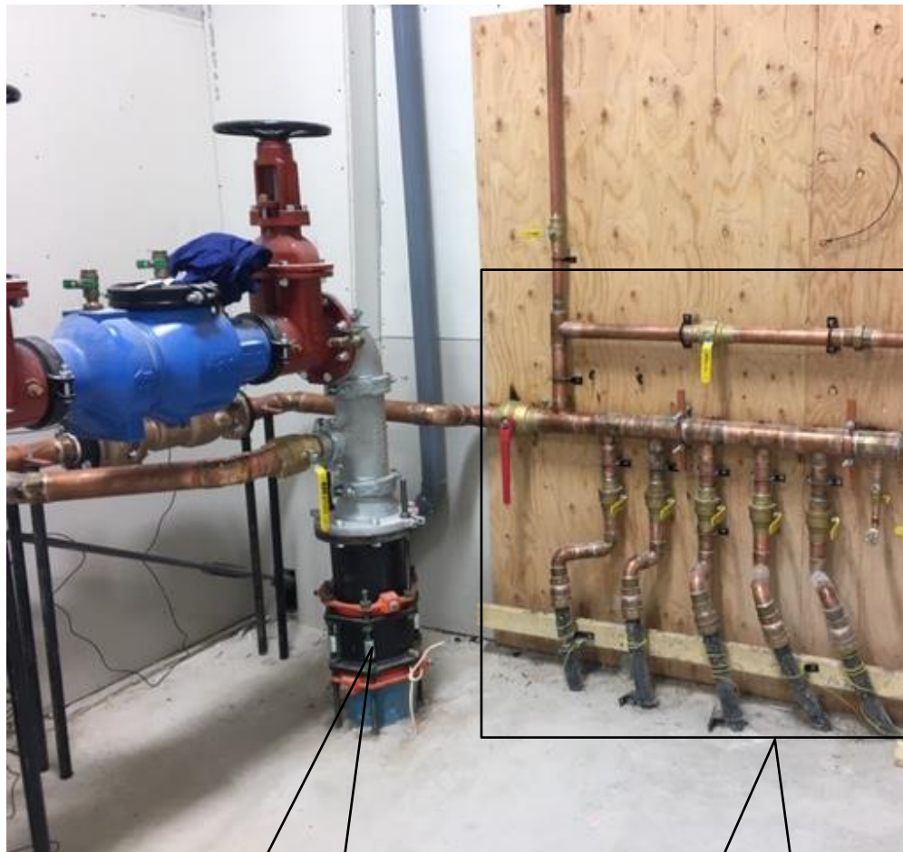
Incoming Water Service Measurement Point